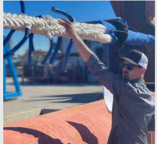
Samson's engineering team has experience working with multiple certifying bodies to get required type approvals for a variety of applications.

To qualify for MEG4 certification, the manufacturing, testing, and documentation steps are carried out as instructed in MEG4 Appendix B, with the results captured on a uniquely formatted Base Design Certificate. A certifying class society (ABS) reviews the product's documentation and alignment to the MEG4 requirements and, upon approval, provides their endorsement on the product's certificate. Having this certification enables the user to be in compliance with the latest industry guidance, adhere to terminal requirements, and easily compare the performance indicators of multiple products while ensuring they meet a performance baseline. For each product, the regime of tests and endorsement must be renewed every 5 years.