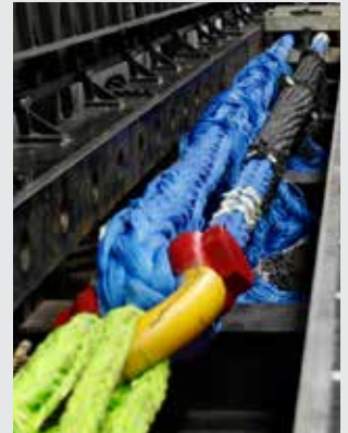
Tests are normally conducted at Samson facilities, but may also be performed offsite at a location approved by the certifying body.