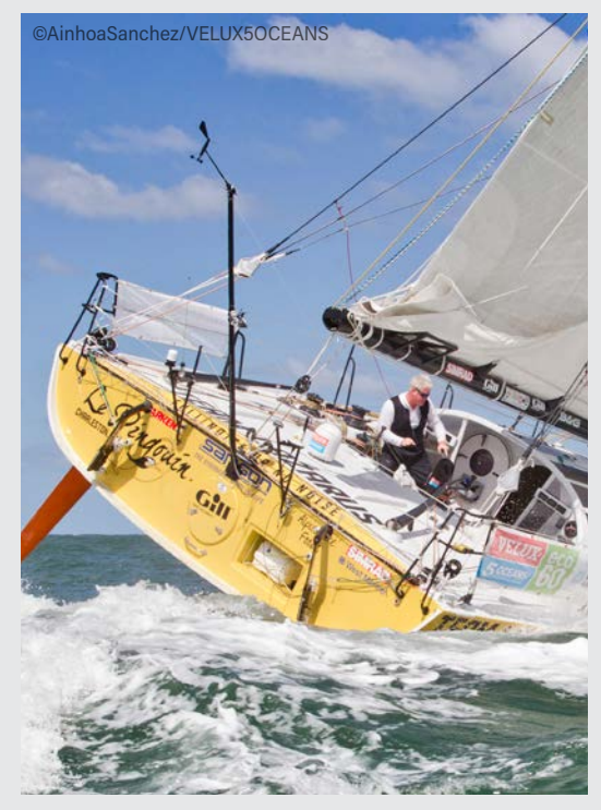
For creep (the time-dependent irreversible elongation of the rope) to be a factor in line selection the rope service life and fiber creep life must be on par.

For additional information on this subject and other available Technical Bulletins, please contact your Samson representative or visit our website: SamsonRope.com