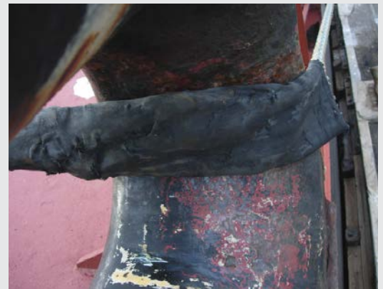
Rough finish as coating wears away.