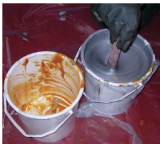
2 part coating mixture (Intershield 300V shown)

STEP 2 COATING PREPARATION Prepare coating per manufacturer instructions (see label and instructions that came with product). Use appropriate personal protective equipment — typically at least safety glasses and rubber gloves.