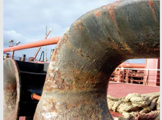
Rust damaged chock typical of crude tankers.

STEP 4 CURING After complete curing (24+ hours depending on thickness and product), hardware can be used.