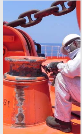
The adhesion and longevity of any paint coating is dependent upon the surface preparation prior to coating.

Recommended procedures are outlined in International Standard ISO 8504:1992(E) and SSPC SP Specifications.