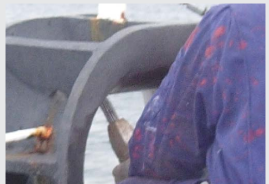
Coating removal using a needle scaler