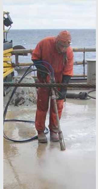
International standards are applicable to surfaces produced by a range of hydroblasting equipment, providing it is capable of cleaning to the visual standard depicted.

Hydroblasting, hydrojetting, and water jetting are essentially the same process under different pressures.