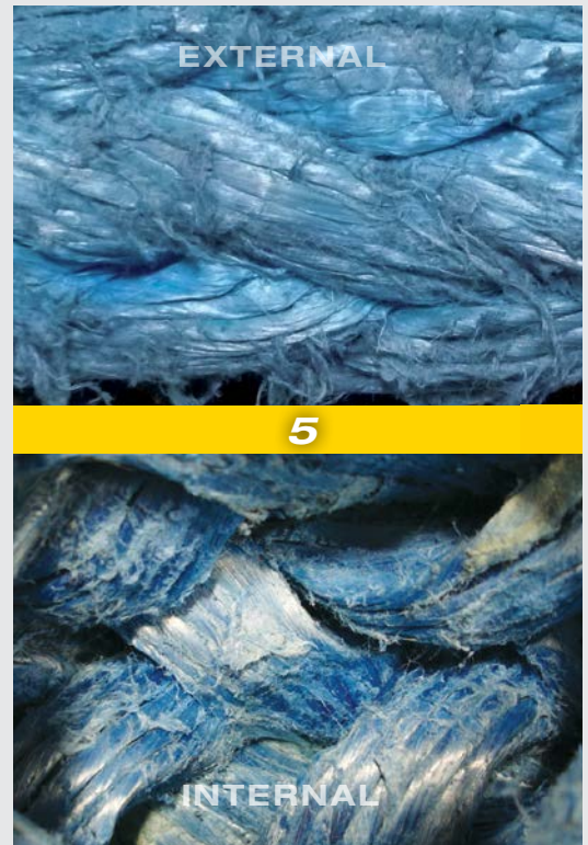
SHOWN AT ACTUAL SIZE: The detailed photos make comparison quick and accurate.