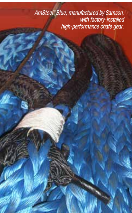
AmSteel®Blue, manufactured by Samson, with factory-installed high-performance chafe gear.

Installing two pumping stations and two manifolds at Petrobras's Cascade and Chinook fields in the Gulf of Mexico at depths in excess of 2,500 meters was accomplished with a "wet handshake" and the assistance of Samson's AmSteel®Blue fabricated into lifting slings for the operation. Technip was the contractor, and Deep Blue was the installation vessel used during the deepwater installation, completed in August of 2009. The project is among the deepest subsea installations in the Gulf of Mexico, and marks the first use of an FPSO in U.S. waters.