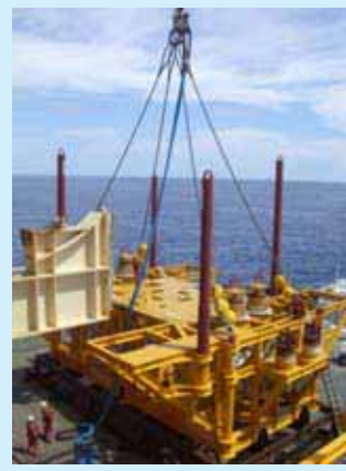
BELOW: ROV handling grommets are used by the ROV to maneuver and position the AmSteel®Blue slings.