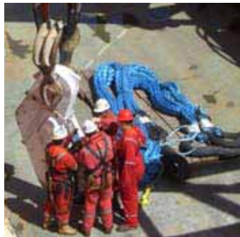
Technip personnel "pre-rig" the hardware packages with the 88-mm AmSteel®Blue grommets.

Samson high-performance synthetic slings help Technip and Petrobras install subsea hardware at the Cascade and Chinook projects.