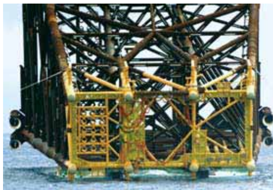
The lightweight, easy handling Quantum-8 slings were attached manually, without the assistance of heavy equipment required by cable-laid or synthetic webbing alternatives, resulting in a faster, more efficient installation.

Quantum-8 is one of a family of high-performance Samson products designed to replace wire rope size for size with the same or greater strength. Typically weighing in at one-seventh the weight of wire ropes, most of these high-performance lines float or are neutrally buoyant in seawater. The chief advantages are extreme strength, light weight, ease of handling, increased crew safety, and significantly longer service life in tough applications.