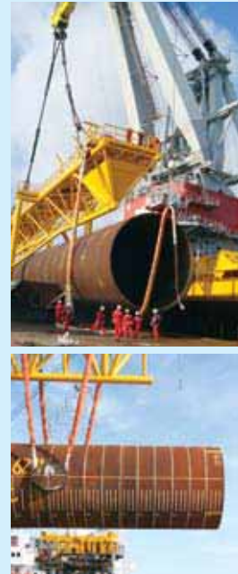
All 140 turbine foundation monopiles were installed using the first set of lifting slings. After completion Lloyd's proof loaded the slings and recertified them for continued use.

Through this process, it has been determined that the original set of slings and grommets can be used again. The second set is still in storage.