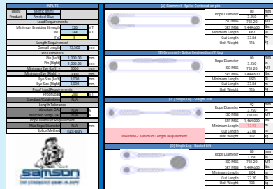
The Configurator, a Samson exclusive.

The Configurator is a proprietary software tool developed by Samson's engineers to quickly analyze the sling requirements, including pin sizes, working load limit (WLL), safety factor, and lengths, to produce options on rope sizes and configurations that will meet the requirements of the project. It allows us to quickly assess the design options available. This unique software tool is available to our master fabricating distributors worldwide, which means faster, more efficient design, fabrication, certification, and delivery of the required slings to your site.