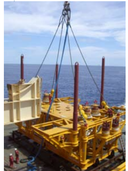
The use of a high-strength, "buoyant," sling was a must for this stage in the process. The hand off from the 400-metric-ton overboard crane to the A&R winch was simplified with the help of the AmSteel®Blue grommets. The foundation piles, pump stations, and manifolds were all "pre-rigged" before the over boarding process.