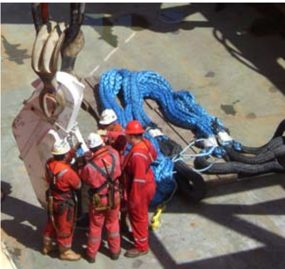
Technip personnel "pre-rig" the hardware packages with the 88-mm AmSteel ® Blue grommets.

The project is among the deepest subsea installations completed in the Gulf of Mexico, and marks the first use of an FPSO in U.S. waters. The wet handshake technique was used to transfer loads from Deep Blue's overboard crane to the A&R winch in the moonpool for delivery to the seafloor and installation.